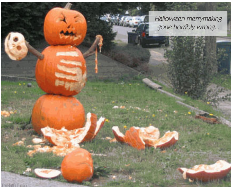
Halloween merrymaking gone horribly wrong...